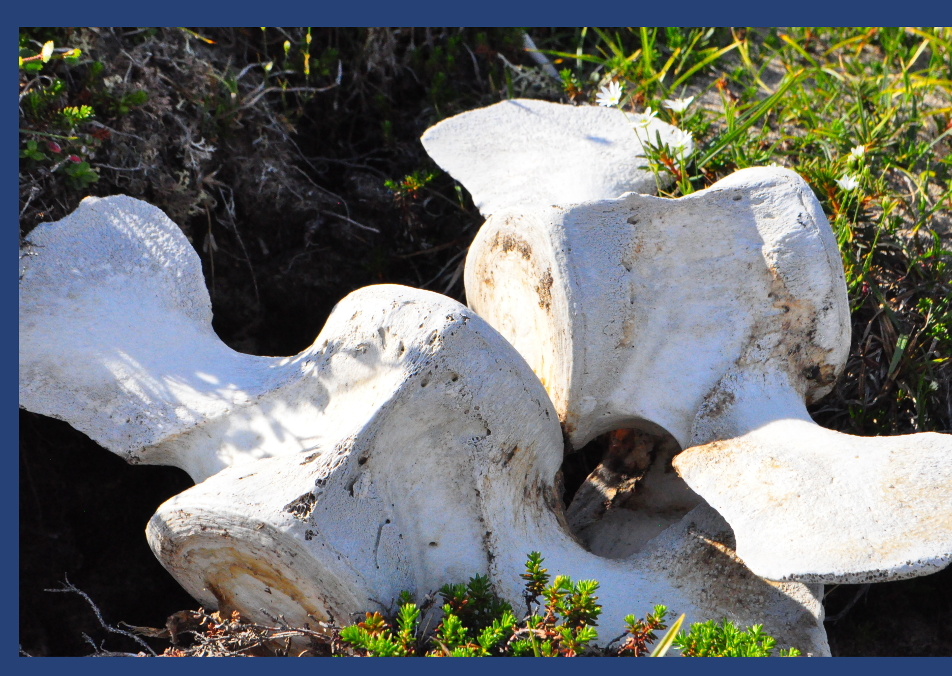
Figure 2: Beluga remains on Hendrickson Island near Tuktoyaktuk