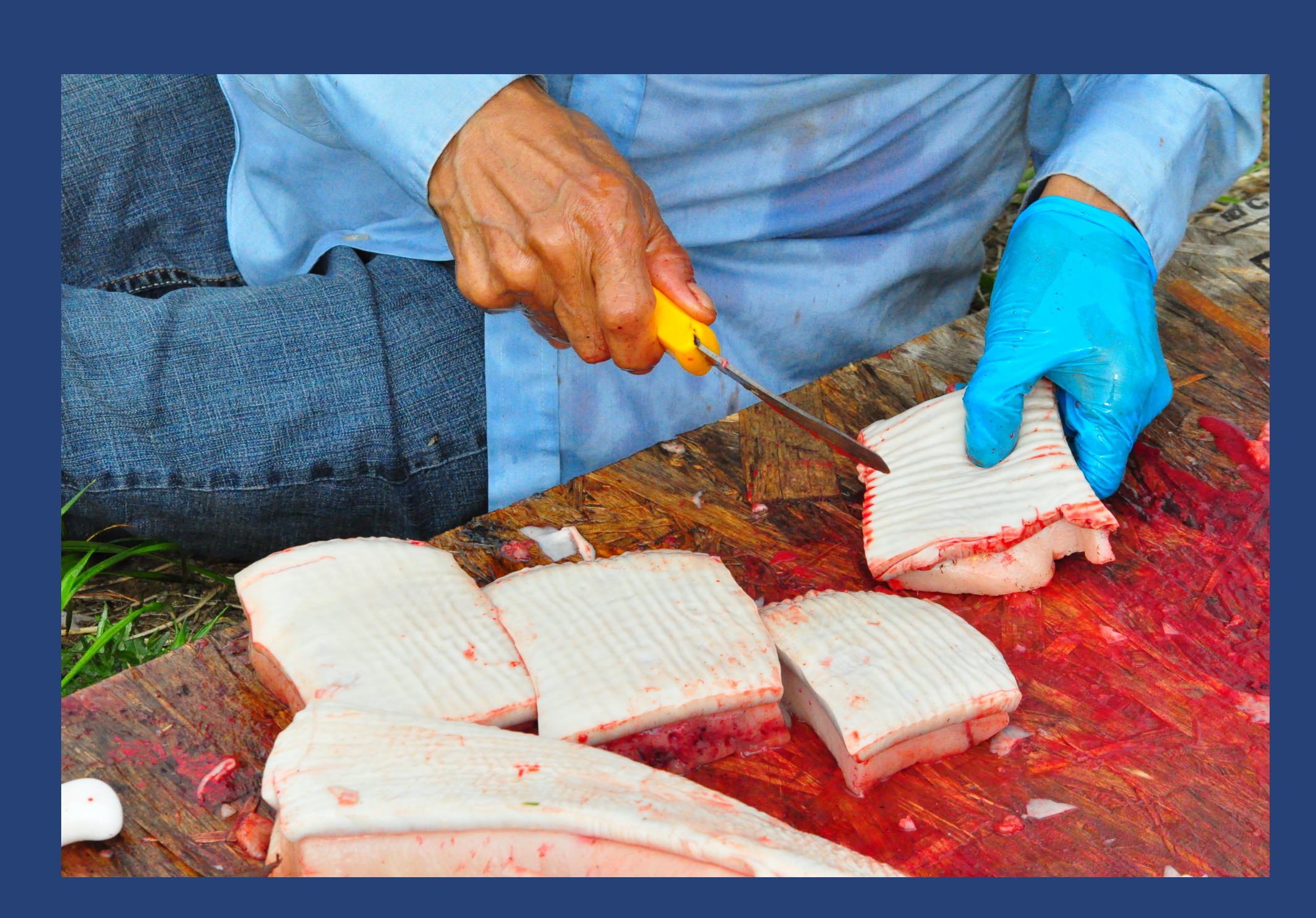
Figure 3: Harvester prepares muktuk on the beach