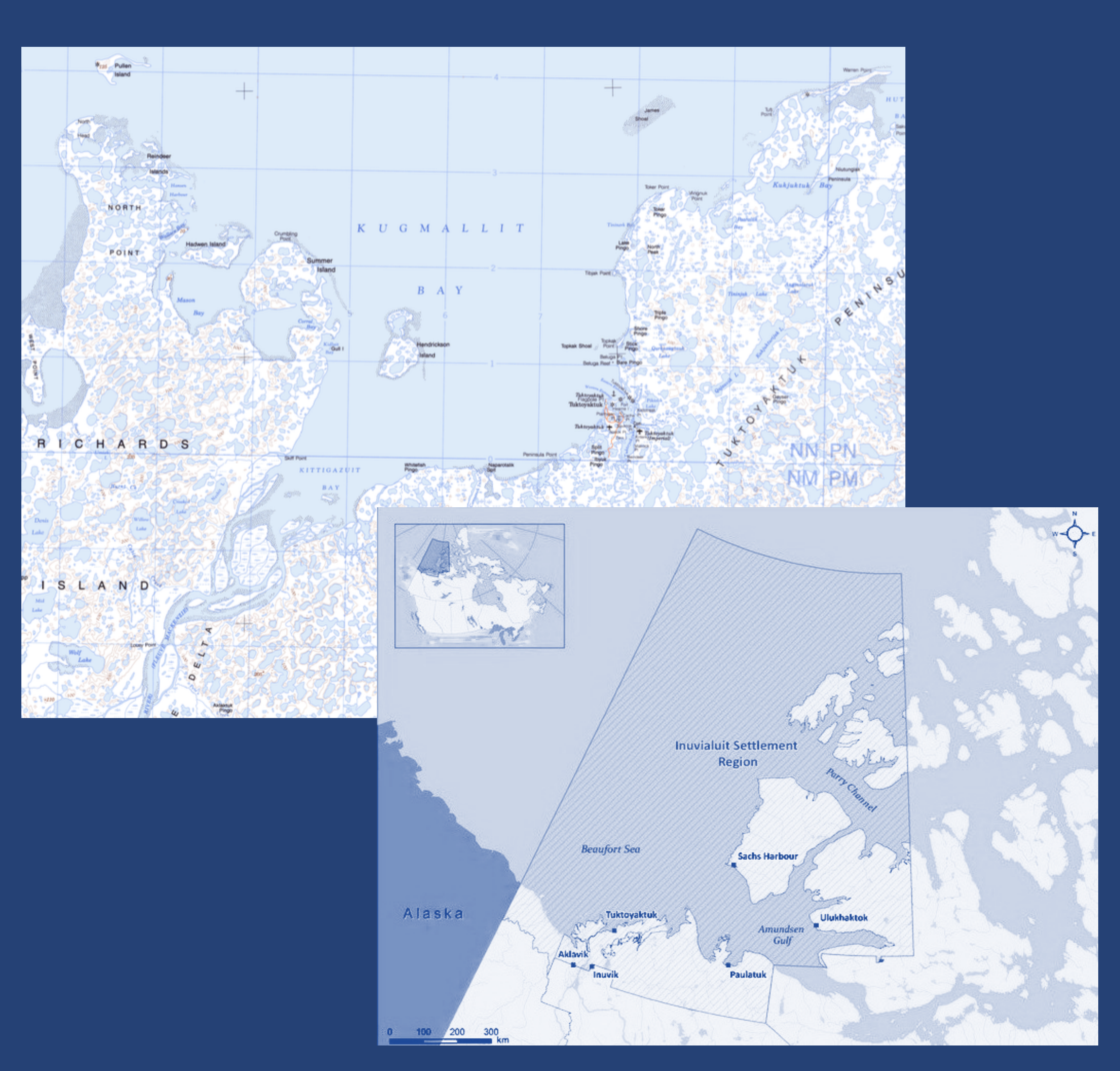
Figure 1: Location of Tuktoyaktuk, NT, and overview of Kugmallit Bay

The research was conducted with Inuvialuit living in Tuktoyaktuk, NT, following established community based research methods<sup>7</sup>. A pre-research consultation was conducted through a community visit and participation in the Inuvik Beluga Summit in February 2016. Data were collected with a local Inuvialuit community researcher during a field season between June and August 2016 using ethnographic field methods including semi-structured interviews and participant observation. Interviews were conducted with 17 active and formerly active harvesters, and included open ended questions and participatory mapping. The interview guide was modeled after a similar study conducted in Ulukhaktok, NT (Pearce & Collings, in review).