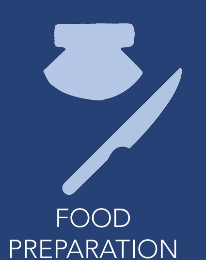
Harvesters typically use beluga for muktuk (skin and thin layer of blubber), uqsuq (beluga oil rendered from blubber), and mipku (dried and salted beluga meat)